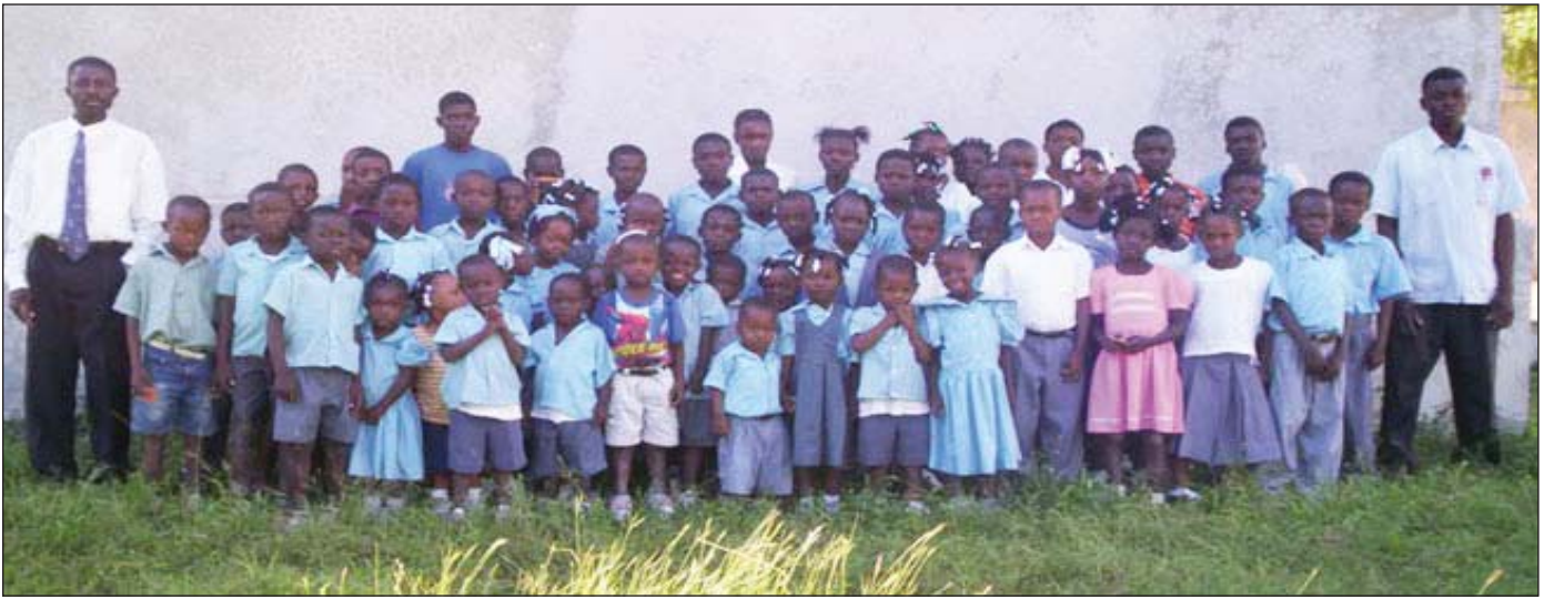
Children of the Ecole Evangelique de Blanket, Blanket, Haiti