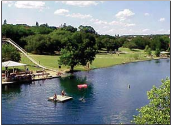
The river slide at Mo Ranch.

ChristChurch to Gather on August 6-8 in the Texas Hill Country