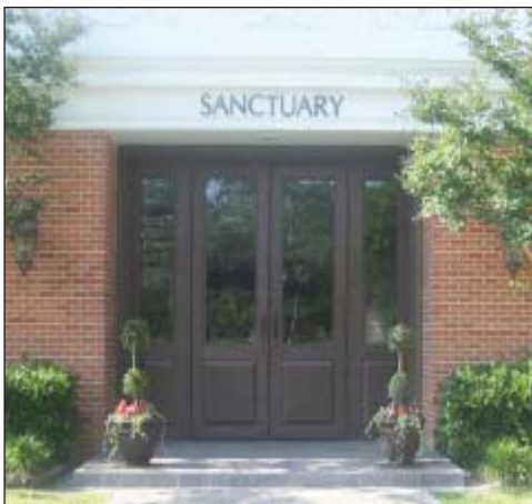
New sanctuary doors

The Session and Building and Grounds Committee are proud to announce the official dedication of the new Sanctuary Entrance. The plaque affixed to the wall inside the new doors will read: