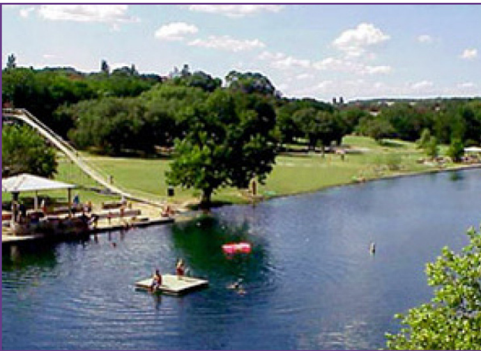
The river slide at Mo-Ranch

ChristChurch to Gather on August 4-7 in the Texas Hill Country